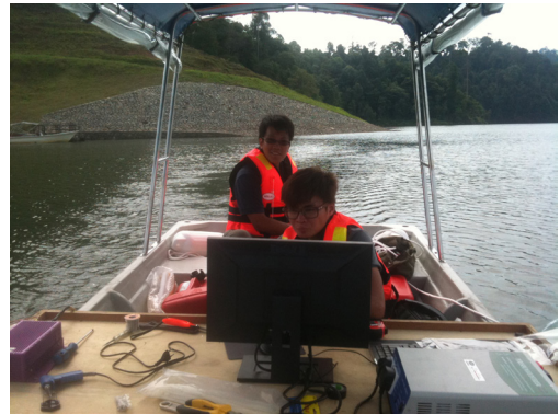
Sound Velocity and Temperature Profiles collected during the survey